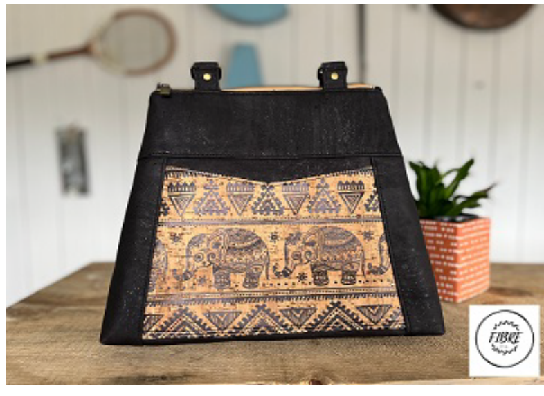
Andrea Black & Elephants - Cork Fabric