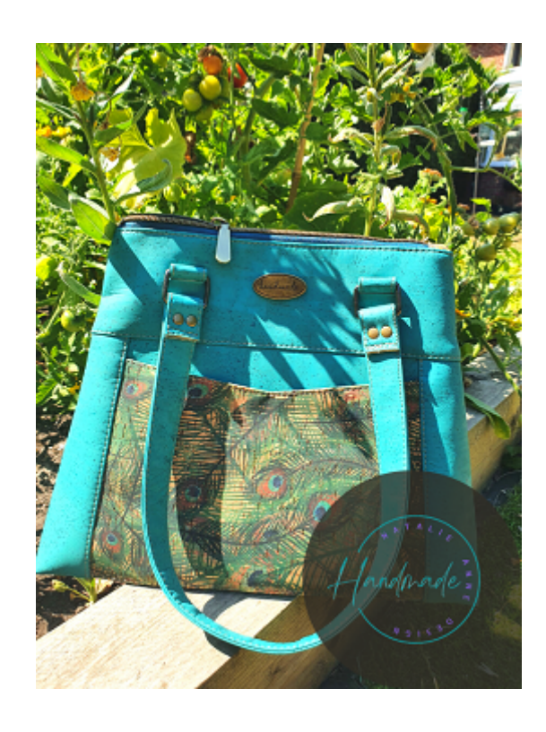
Blue & Peacock Cork Fabric