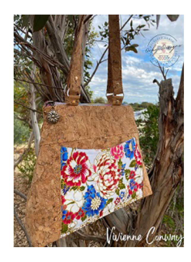
Natural Cork Fabric & Floral Cotton Recycled Denim